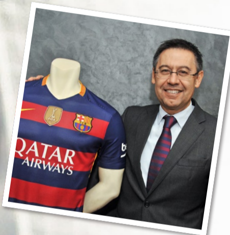
THE THREE AMIGOS: (l-r) Suarez, Neymar and Messi are the pride and joy of Barca president Josep Maria Bartomeu (above)

League in Paris [in 2006]. If you look at coaches which are a reference for this club, they are the ones that win.